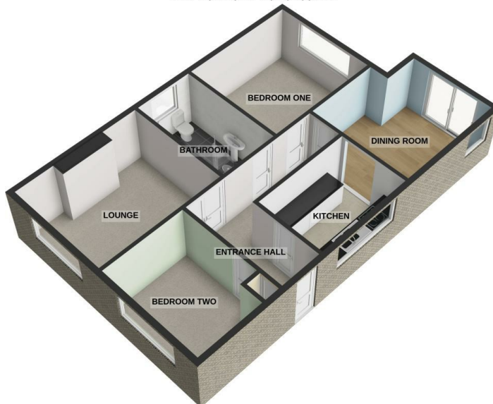
GROUND FLOOR 76.6 sq.m. (825 sq.ft.) approx.

For illustrative purposes only. Decorative finishes, fixtures, fittings and furnishings do not represent the current state of the property. Measurements are approximate. Not to scale. Made with Metropix © 2025